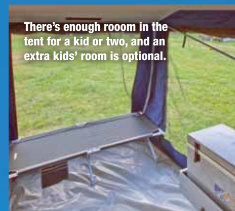
There's enough room in the tent for a kid or two, and an extra kids' room is optional.