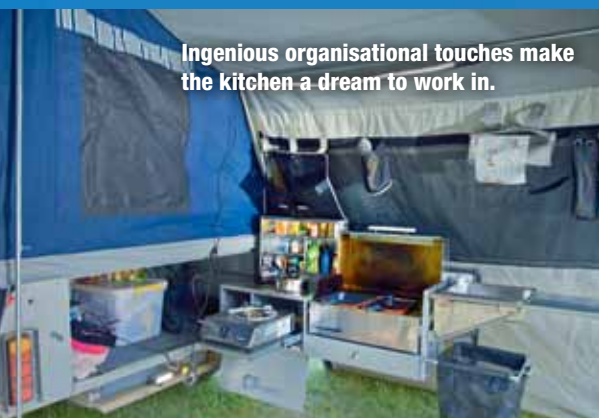
Ingenious organisational touches make the kitchen a dream to work in.

Being new to the camper trailer market I thought that getting six days to climb all over 15 of the best offroad camper trailers in Australia would make it easy to pick a clear favourite — but it's not so. Having a young family has definitely helped me to narrow down the choices. For me, though, a major factor has also been the size of the unit, both hooked up behind my 'Cruiser and all set up. As I've learnt on the last couple of family camping trips, small people need a lot of stuff, so large storage areas are a must. I also know at the end of the day I'll be the one putting the tent up and packing it down while the kids are annoying their mum, or 'helping' dad, so an easy set up is a must. In the end, the camper trailer which caught my eye was the Johnno's Evolution. I like the short length (4.2m), simple set up (only four pegs needed for an overnight stop), the internal space (enough room for a couple of rug rats on the floor), great kitchen (it has the Sovereign barbecue plate) and the fact that it is a simple yet rugged trailer with storage galore underneath. It might not have all the bells and whistles of some of the others but I'd feel confident that if I broke it I was probably doing something stupid... but that's a different story!